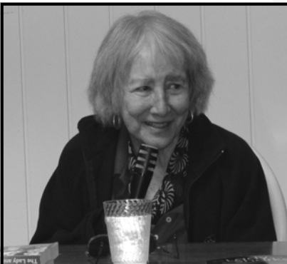
Dr. Eugenie Clark